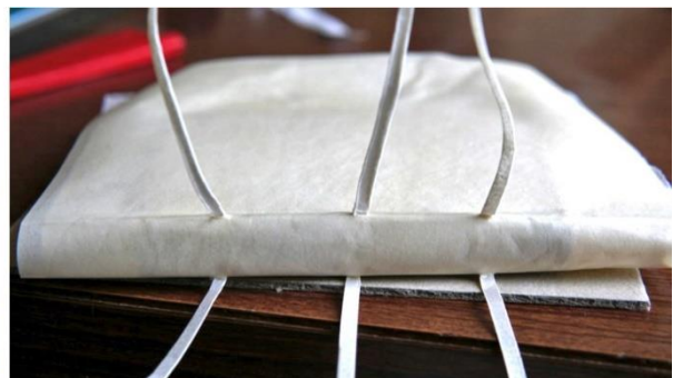
The small de Bray model sewn onto vellum