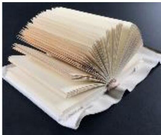
The finished Romanesque binding – fanned.