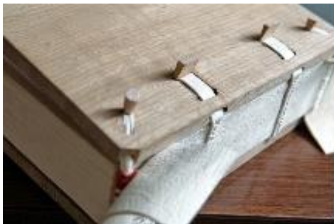
Oak boards attached by pegging sewing supports in place.