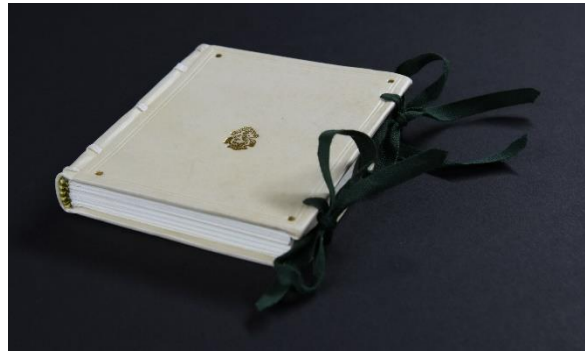
The finished de Bray model

edges and squares, instead trusting to our 'eye' to make cuts and position elements of the binding correctly. The de Bray method was to sew the textblock onto long vellum supports, which were tapered to form 'spitsels' that are then laced into a limp vellum cover before the boards are inserted and pasted in place. Thanks to the direction of Anne and Maria, it was surprisingly easy to follow the steps in the manual albeit with the occasional discussion as to exactly how many millimetres were equal to a 'straws breath'.