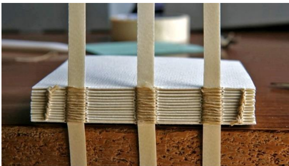
The small de Bray model sewn onto vellum supports