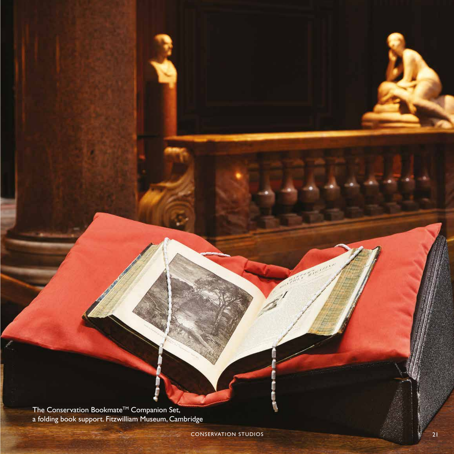
The Conservation Bookmate™ Companion Set, a folding book support. Fitzwilliam Museum, Cambridge